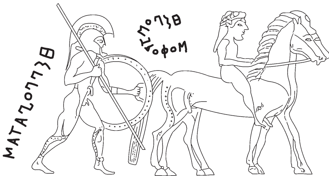
Fig. 4. Detail of an Early Ripe Corinthian aryballos: hippobatas and hippostrophos (drawn after Alföldi 1967, 14 fig. 1).

This much is presumably known by anyone familiar with Greenhalgh's book. I should, however, like to draw attention to the equipment used by the hippobatai , and in particular the bell-shaped cuirass and the Argive shield. The bell-shaped cuirass, so called because of its distinctive shape, was made of bronze and consisted of two halves; one covering the chest, the other the back. These two plates were hinged on one side and fastened with buckles on the other. Snodgrass was perhaps the first to suggest that the bell-shaped cuirass was developed specifically for use by horsemen. 53 The design of this type of cuirass allows the wearer to sit on one's haunches, 54 as well as ride comfortably on horseback. 55 It is surprising, however, that few authors have drawn any conclusions from these facts, and that most are content to consider it primarily as a piece of armour worn by infantrymen, pure and simple.