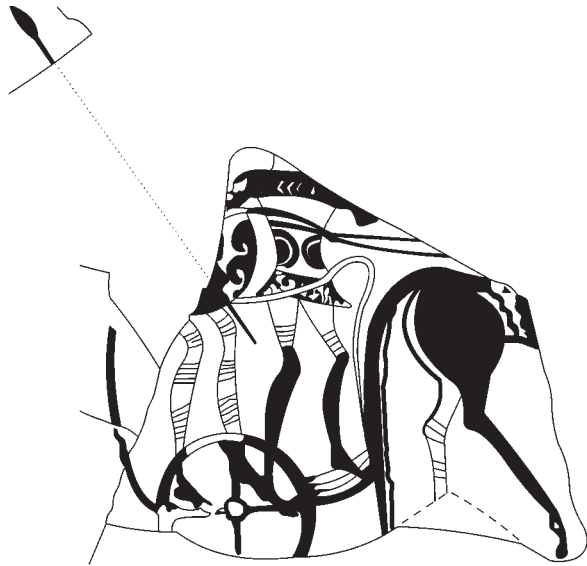
Fig. 2. Mykenaian chariot; fragments of a Late-Helladic-III C krater found at Tiryns (drawn after Vermeule/Karageorghis 1982 plate XI.16).