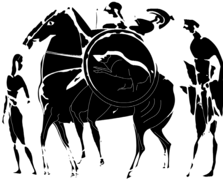
Fig. 7. Detail of a 6 th -century Attic black-figure vase with dismounting warrior (drawn after Greenhalgh 1973, 120 fig. 62).

lacking is the spear, but this omission might be attributed to the complexity of the composition (explaining perhaps, why the scene on the aryballos is so 'clumsy'). The difficulty in portraying such a dynamic scene might also explain its rarity in early Greek art. Nevertheless, a few other examples are known, some of which are Attic and usually date to the 6 th century BC. 61 One example, also included in Greenhalgh's study, 62 is illustrated in figure 7.