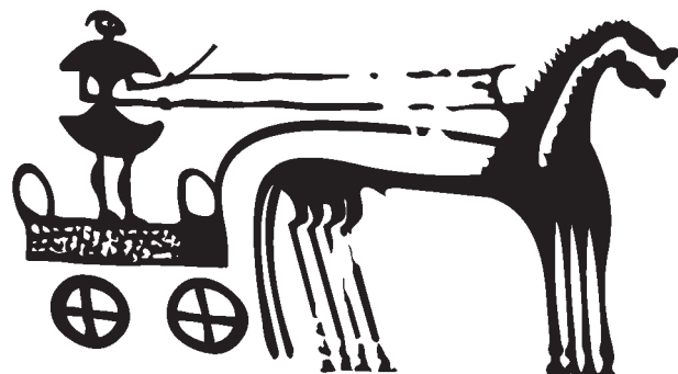
Fig. 1. Warrior with Dipylon shield on chariot, from a Late Geometric Attic krater (drawn after Greenhalgh 1973, 33 fig. 26).

I wish to re-examine some of the developments in Greek warfare during the 7 th century BC. I believe that some of the elements long considered to have been typical of infantry warfare were actually developed specifically for use by men who spent much of their time on horseback. Thus, this article in a way resurrects an idea first postulated by Detienne in 1968, who suggested that the first hoplite phalanxes may well have been mounted. 3 Because of the emphasis put on mounted warriors, the article also extends, and to a certain degree revises parts of, the well-known book written by Greenhalgh on early Greek chariots and horsemen. It also incorporates some of the suggestions made by Anderson and Snodgrass to arrive at what I hope to be an overview of the developments in Archaic Greek warfare that better incorporates all of the available evidence than has hitherto been the case.