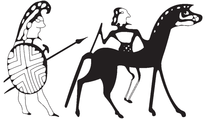
Fig. 3. Detail of an Early Protokorinthian aryballos by the Evelyn Painter (drawn after Shanks 1999, 76 fig. 3.3).

Greenhalgh is undoubtedly correct in attaching great value to the use of the horse in combat. He suggests that 'The horse's role in transporting the warrior to and from the battlefield and for pursuit and flight continued to be valuable in hoplite warfare as in the earlier style, and Helbig was right to speak of earlier aristocracies of knights as mounted footsoldiers.' 41 However, after the introduction of phalanx-tactics, Greenhalgh argues, the war-horse 'could only be used for transporting him [the hoplite] behind the lines, and for pursuit and flight.' 42 This idea stems from the (orthodox) assumption that horses and hoplites cannot mix freely when on the battlefield, since the phalanx is thought to be a tightly-knit formation.