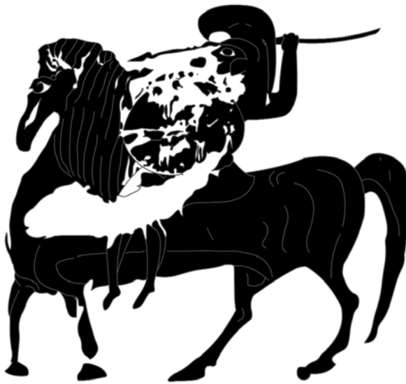
Fig. 5. Detail of an Early Ripe Corinthian aryballos: warrior leaping from his horse (drawn after Greenhalgh 1973, 87 fig. 48).